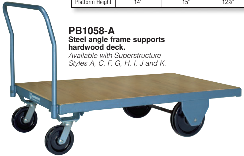
PB1058-A Steel angle frame supports hardwood deck. Available with Superstructure Styles A, C, F, G, H, I, J and K.