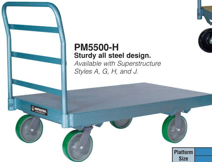
PM5500-H Sturdy all steel design. Available with Superstructure Styles A, G, H, and J.