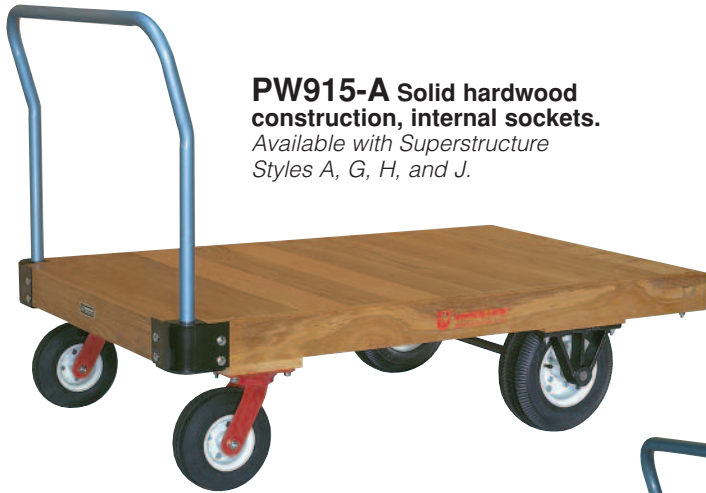
PW915-A Solid hardwood construction, internal sockets. Available with Superstructure Styles A, G, H, and J.