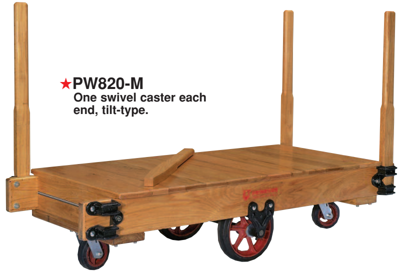
★ PW820-M One swivel caster each end, tilt-type.