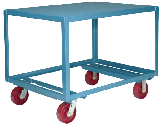
Table Trucks SH5030 Capacity 1,500 lbs.

* Capacity limited to 1,200 lbs. with 8" Pneumatic tires.