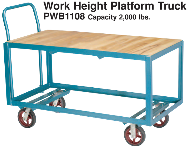
Work Height Platform Truck PWB1108 Capacity 2,000 lbs.

Shelf Trucks Capacity Range 600 – 6,000 lbs.